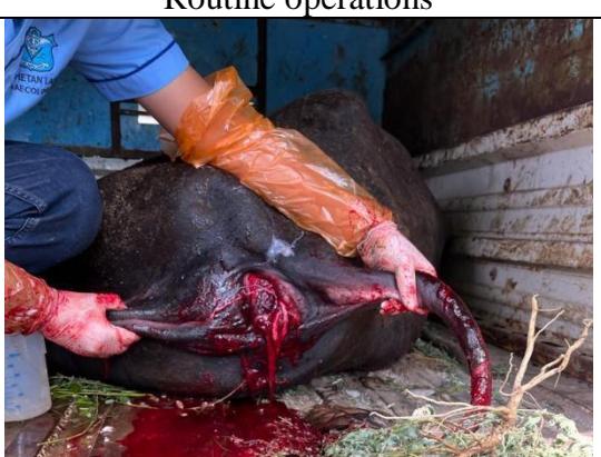
Post Partum Complications